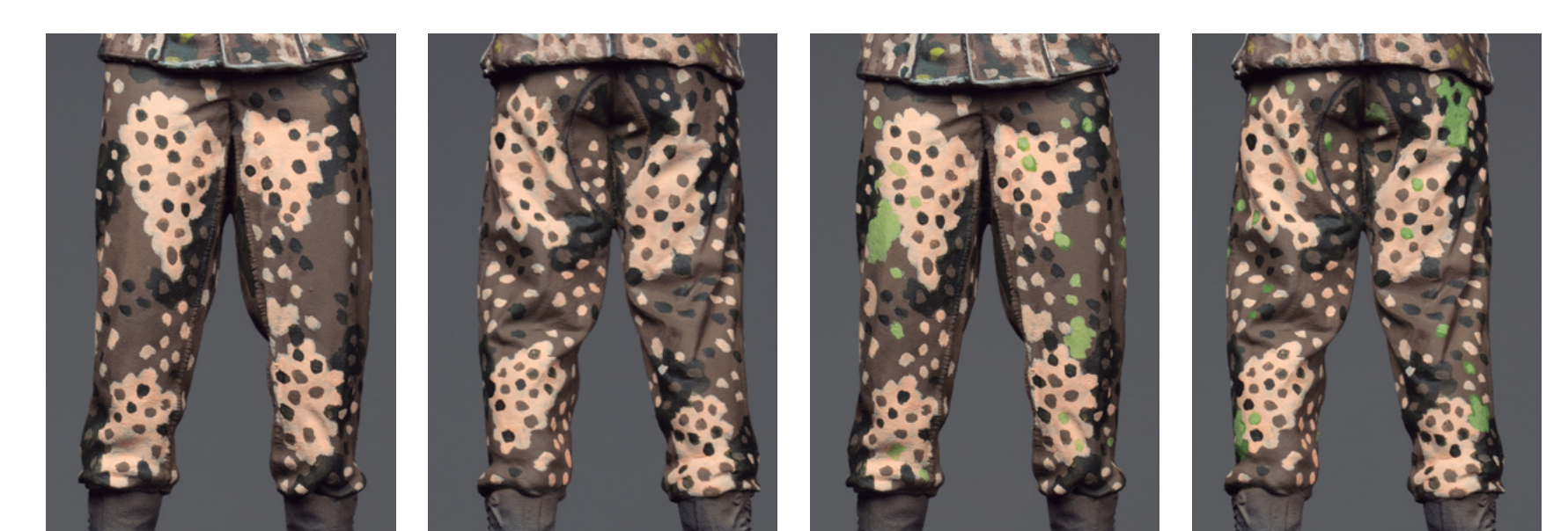
Inside the darker big spots I draw smaller ones. I use the Now I paint the spots light green. base color and sand color from the previous steps.