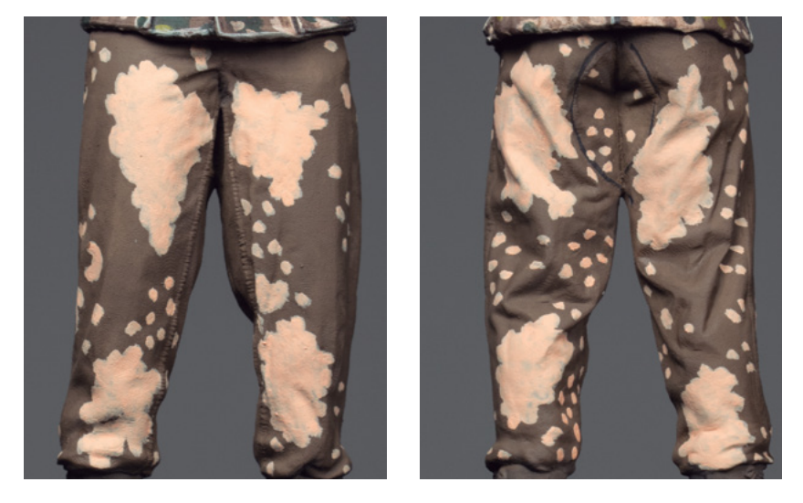
I start the camouflage pattern by drawing, with a sand color, the lighter spots. I use a good quality brush with the tip in good condition.

I apply several coats of base color until the finish is completely uniform. I let each coat dry before applying the next.