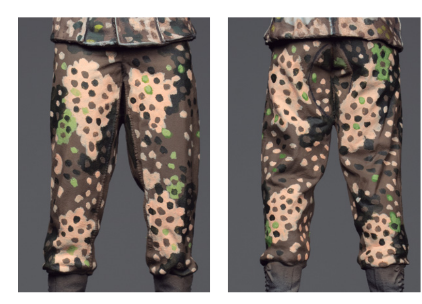
I draw a few small spots within the larger light green spots. I use the base colors, sand and dark green above.