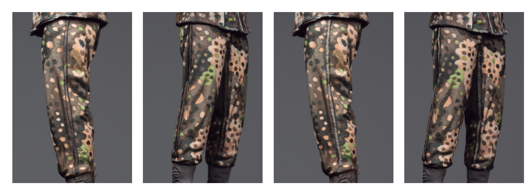
With a very dark color I outline the inside of the seams.