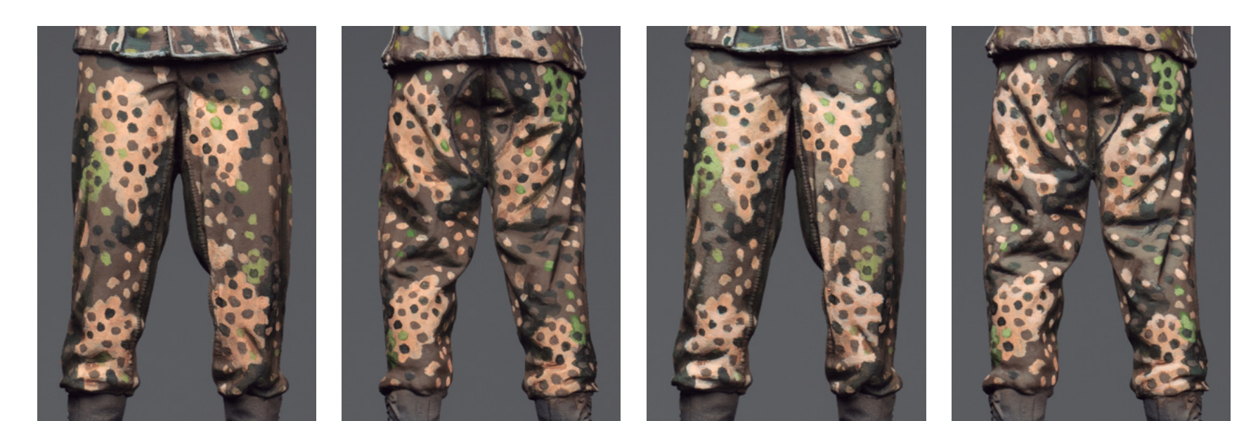
I apply several layers in the shadow areas using the same shade from the previous step.