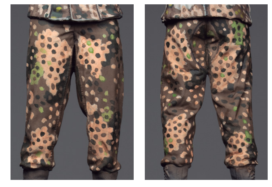
I apply a general wash with very diluted chocolate brown. This helps us to integrate all the colors of the camouflage.