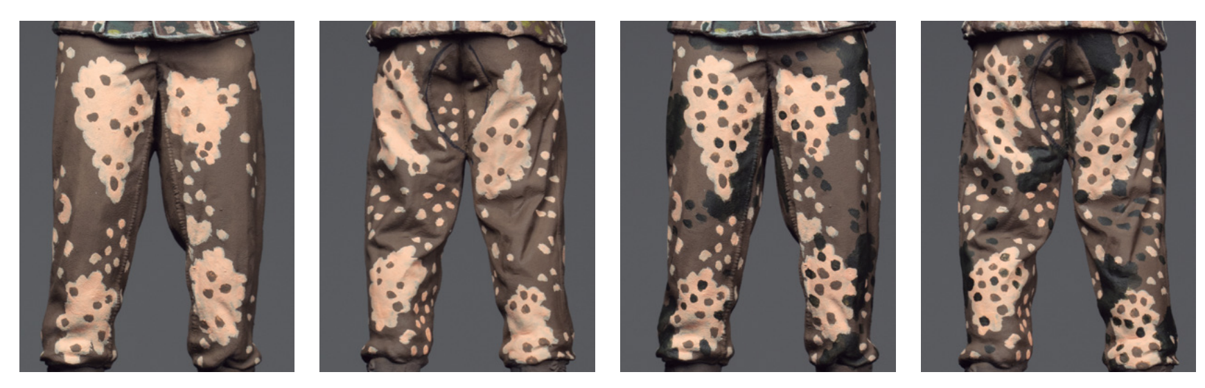
With the base color I paint a few small spots inside the large light spots.